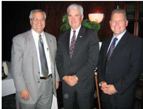
Trezza Media Group & The Flyzik Group's Executive SI Roundtable with HHS in May See more photos here.

June IT Infrastructure Consolidation (Open for 2 sponsors) July Border Protection Security (Unisys-Sold Out) August Network Centric Warfare & Operations (Open for 2 sponsors) Sept. Health IT (Open for 2 sponsors) Oct. Identity Management/HSPD-12 (Open for 2 sponsors) Oct. Special ELC Conference Program (Information to follow) Nov. Future Combat Systems (On-Hold) Dec. Open Source Computing (Open for 2 sponsors)