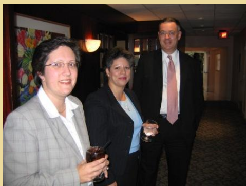
Trezza Media Group & The Flyzik Group's Executive SI Roundtable with DHS in August